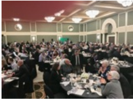
2018 LICO Convention banquet