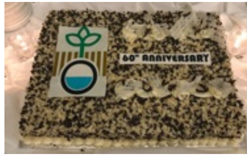
Cake celebrating the 60th anniversary of LICO